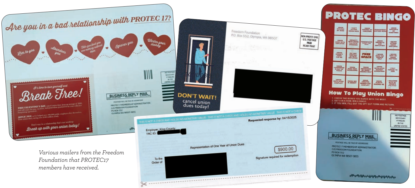
Various mailers from the Freedom Foundation that PROTEC17 members have received.